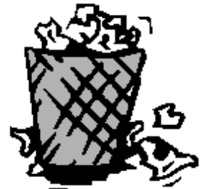
Trash Update Page 3