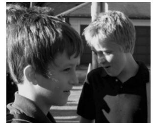
School pictures Page 2

What has been your experience of Church? What do you want your experience of Church to be? We absolutely need you to effect this!