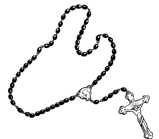
Month of the Rosary